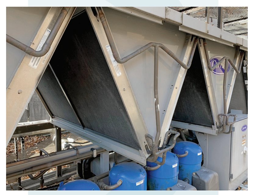
* Carrier 30RB and 30XA are registered trademarks of Carrier Corporation, a unit of United Technologies Corp.